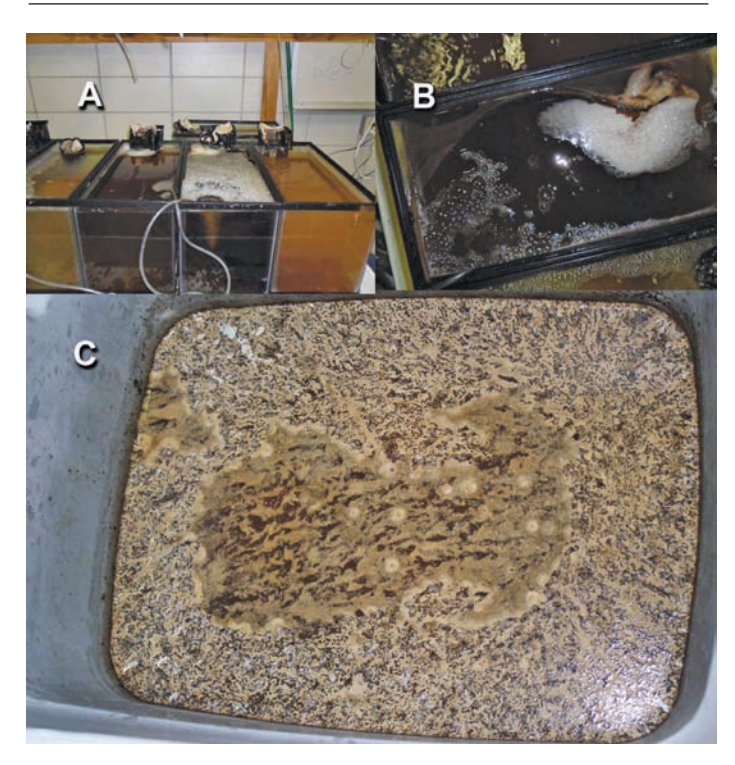
Figure 4. Examples of quarantine aquaria. A. The oil ingested by the corals turned the water black after 48 h (10 August 2011). B. Day 5 in quarantine tanks (13 August 2011), the corals continued to purge oil. Brownish black foam appeared on the surface. C. The dead coral continued to leach beige foamy crude oil after 28 d in fresh water (8 September 2011). The surface oil in the container is similar to crude oil slicks observed offshore (Figure 2).

Coral samples have been collected at the GI 90 block platforms since 10 July 2005, including eight occasions between 14 June and 21 October 2010, during and shortly after the MC–252 blowout period. Prior to 8 May 2011, we