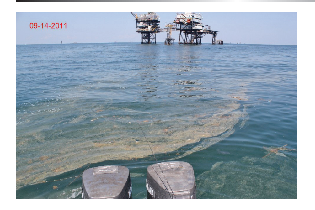
Figure 2. Oil slicks observed over a 10 km wide area during a sampling trip to GI 90 block platforms on 14 September 2011, 13 mo after the BP well had been capped. The foamy beige surface oil was similar in appearance to the oil discharge from coral skeletons (see Figure 4C).

We returned to the GI 90 block platforms on 14 September 2011 for additional coral collections; however, the collection trip was cancelled due to the presence of large crude—oil slicks near the GI 90 block (Figure 2).